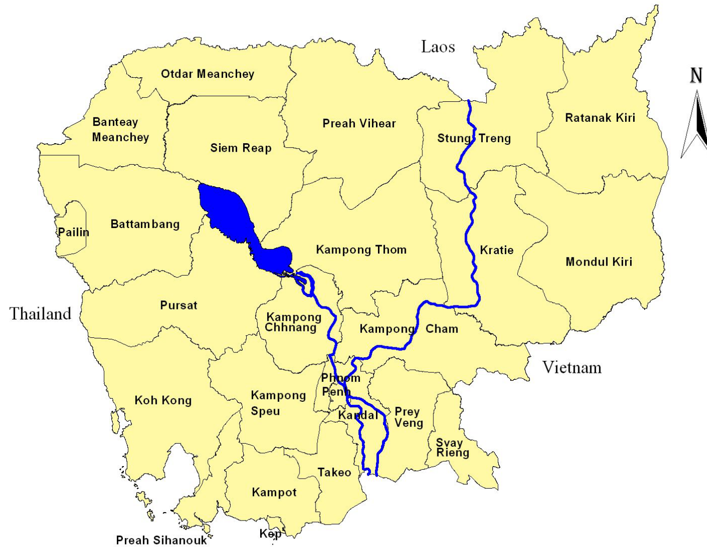
Map 1. Cambodia by Province