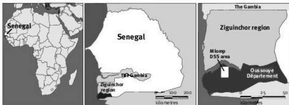
Figure 25.1. Location of the Mlomp DSS site, Senegal (monitored population, 6200).

The Mlomp DSS site, about 500 km from the capital, Dakar, in Senegal, lies between latitudes 12°36' and 12°32'N and longitudes 16°33' and 16°37'E, at an altitude ranging from 0 to 20 m above sea level (Figure 25.1). It is in the region of Ziguinchor, Département of Oussouye, in southwest Senegal, near the border between Senegal and Guinea-Bissau. It covers about half the Arrondissement of Loudia-Ouolof. The Mlomp DSS site is about 11 km × 7 km and has an area of 70 km 2 . Villages are households grouped in a circle with a 3-km diameter and surrounded by lands that are flooded during the rainy season and cultivated for rice.