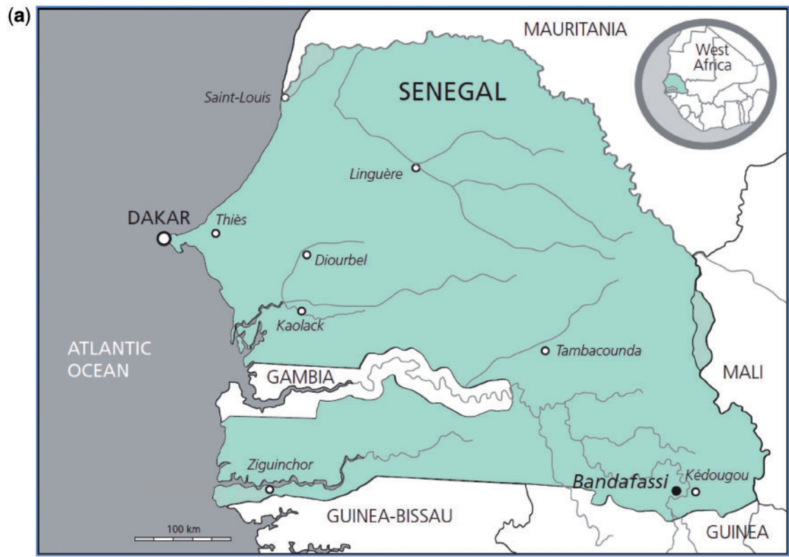
Figure 1a. Location of Bandafassi HDSS in Senegal.